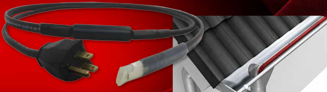
ELSR-NA Pre-assembled Kits 120V, 7W/ft @41°F