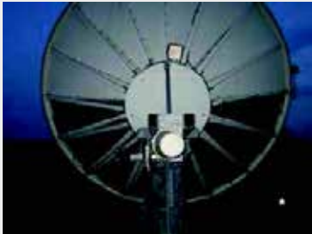
4.5 m Antenna