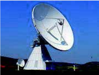
25 m Antenna