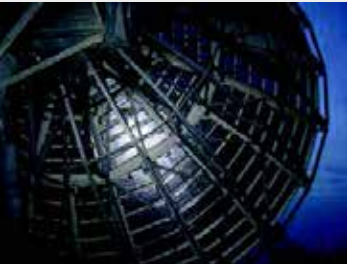
11 m Antenna